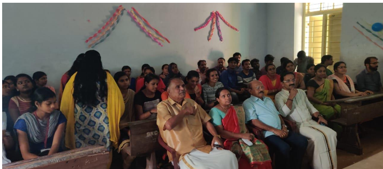
Participants of “Alumni Meet – 2019”