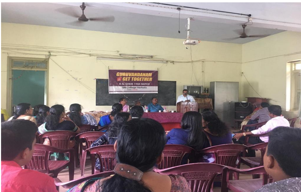
Audience of “Alumni Meet – 2018”