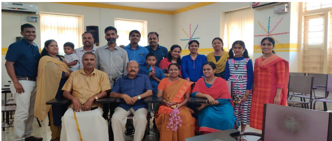
Participants of “Alumni Meet – 2019”