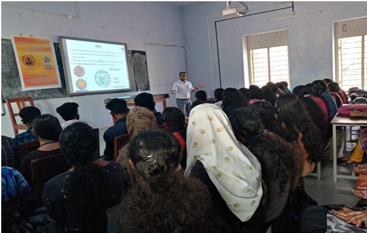
Talk on viruses